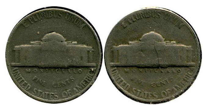
Figure 3 – 1944 "Henning" Nickel Reverses

silver 1944-P war nickel today sells for whatever the silver spot value says common war nickels go for. Meanwhile a quick search of eBay completed auctions and buy it now listings shows a "Henning Nickel" realizes between $75 and $125! There are of course outliers both bargains and the unbelievables. Interestingly there was a 1939 "Henning Nickel" on eBay in August 2020 described as ultra-rare with the looped R that had a buy it now price of $999. It sold! The imitator now seriously trumps the real thing!